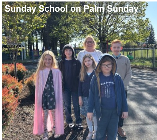
Sunday School on Palm Sunday