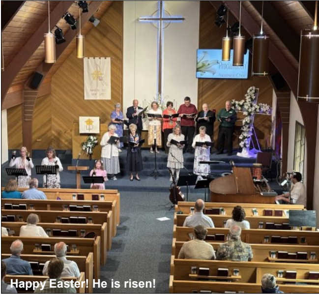
Happy Easter! He is risen!