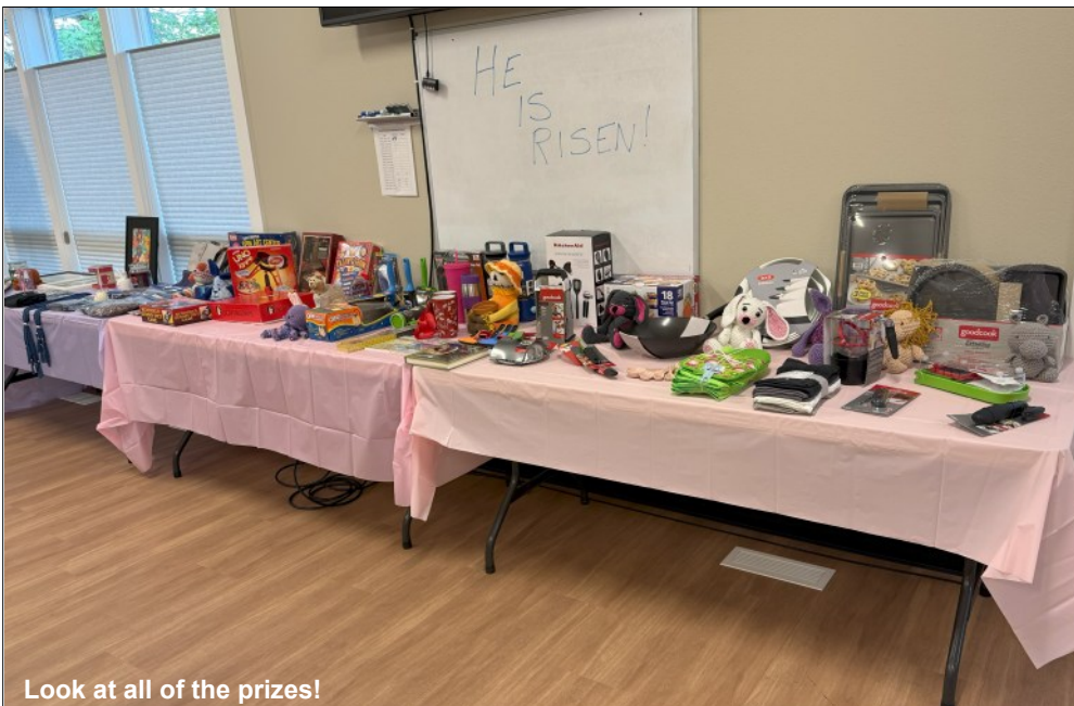
Look at all of the prizes!