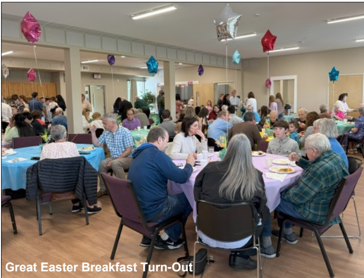
Great Easter Breakfast Turn-Out