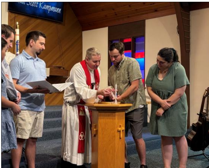
The water of Baptism