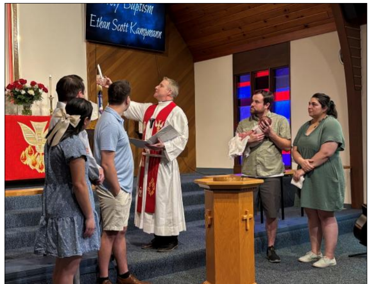
The Light of Christ