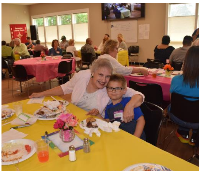
Enjoying our lunch and fellowship