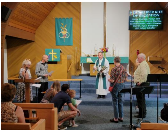
Celebrating affirmations of faith and new members