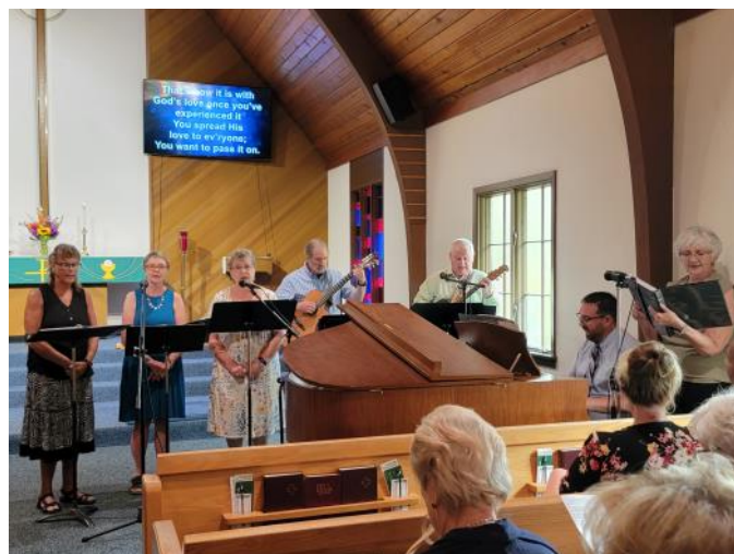
Praise team sings