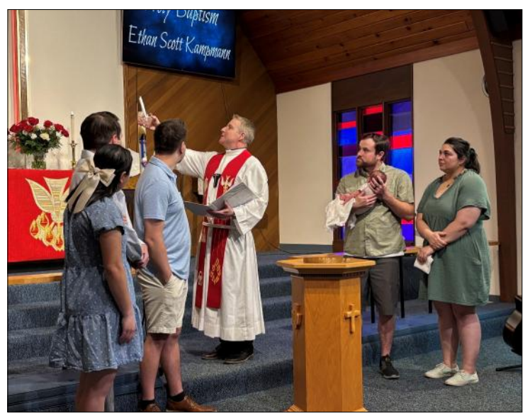
The Light of Christ