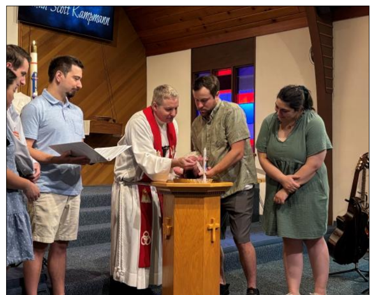
The water of Baptism